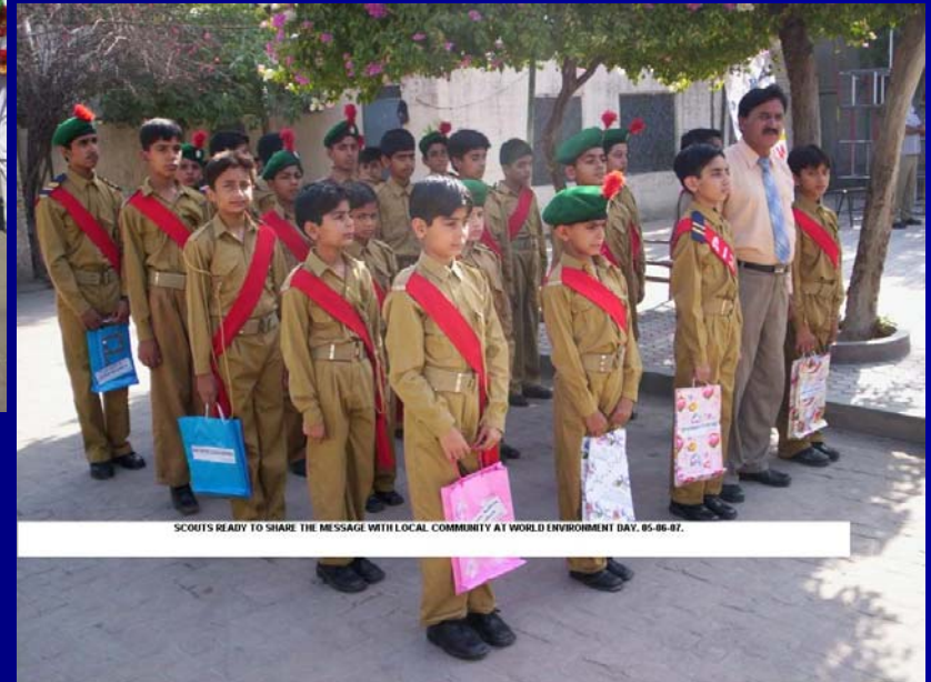
SCOUTS READY TO SHARE THE MESSAGE WITH LOCAL COMMUNITY AT WORLD ENVIRONMENT DAY, 05-06-07.